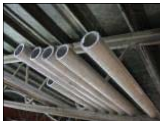
CROSS ARMS & MET SENSOR MOUNTING BRACKETS