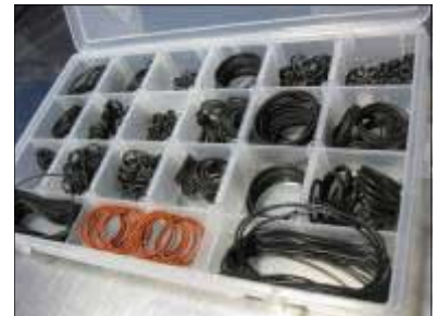
O-RINGS AND GASKETS