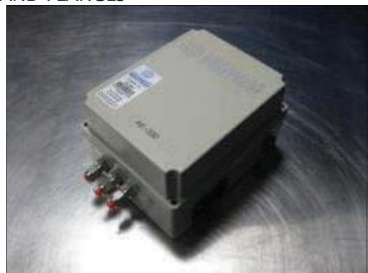
CALIBRATION PORT SWITCHES

American Ecotech 100 Elm Street, Factory D Warren, RI 02885