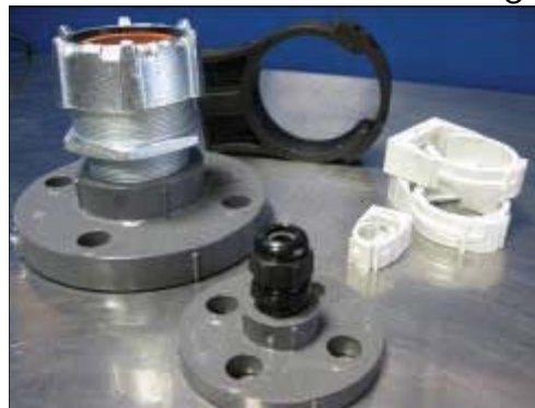
CLIPS, CLAMPS, COMPRESSION FITTINGS AND FLANGES