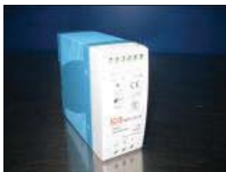
12V-24V DC POWER SUPPLIES