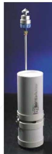
MicroVol 1100 with PM 10 inlet and optional battery pack

The MicroVol-1100 Weather Station can continuously update parameters via the internet and provide up-to date weather details. The MicroVol-1100 can store up to 2 days of 15 minute average data which is accessible through the internet or via RS-232.